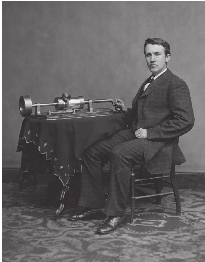
Edison with his phonograph invention.

Thomas Edison died in 1931; he was 84 years old. Almost everyone in the world has used at least one of his inventions: the electric lightbulb. We are still using them today, almost 100 years later!